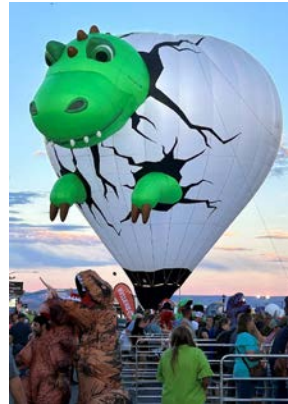
Ashley Regional proudly sponsors and actively participates in local community events, like DinahSOAR Days, to foster strong community connections.