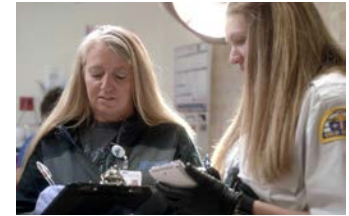
Ashley Regional Medical Center serves as a stroke receiving facility and a chest pain accredited center. It is also the only Level 4 Trauma Center and Level 2 Neonatal Intensive Care Unit (NICU) in the region.