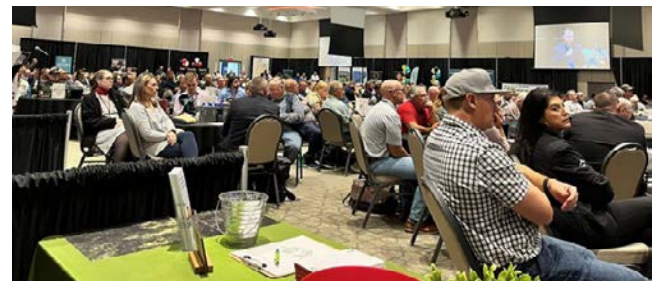
Our Step One Services team participated in and provided education to community members at the Uintah Basin Energy Summit.