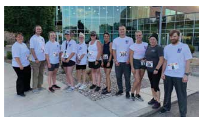
ARMC team members participated in the Firecracker 5K on July 4, 2022.